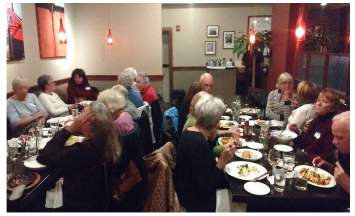
Happy Villagers at November's Members & Volunteers dinner

say that although she has many connections in her professional life and the geographic area, living far from her family of origin, "belonging to an ongoing community committed to helping each other was missing in my life." And now, with the Village, it's no longer missing!